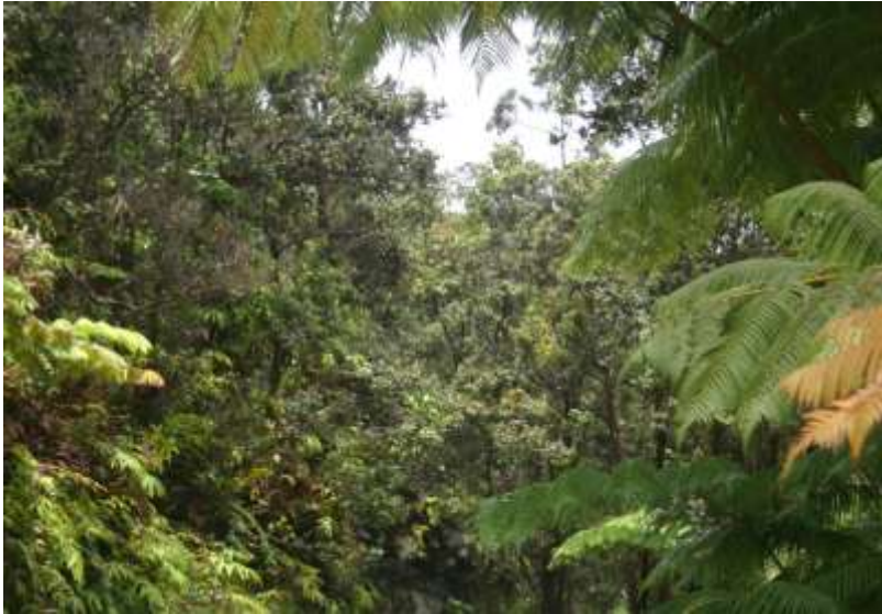
‘Ōhi‘a Lehua-Hāpu‘u Rainforest

Hawai‘i Volcanoes National Park has special things to see and touch. It is a beautiful place to discover special plants and animals by using your senses.